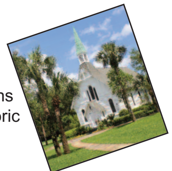
Lovely Lane Chapel

More Information and Online Registration: www.epworthbythesea.org .